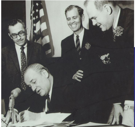
Gov. Winthrop Rockefeller signing the Arkansas Freedom of Information Act into law on February 14, 1967.

If the body persists, the reporter should notify his or her supervisor immediately, and the citizen should contact the prosecuting attorney.